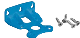
-S- wall bracket wall bracket screws