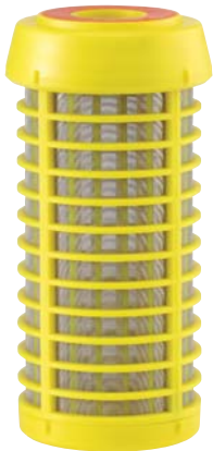
RAH cartridge 90 micron stainless steel net AISI 316