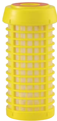
RLH cartridge 90 micron polyester net