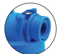
IN female plastic in/out threads 1/2", 3/4", 1", 1 1/4, 1 1/2