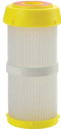
RSH cartridge 50 micron pleated polypropylene net