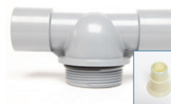
2.5" Bottom Drain Plumbing for Res./LC Filters.