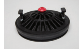
Top Cap option with pressure release Valve & Removal Handles