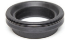
4.5" Threaded top/bottom Commercial Cap threaded connection.