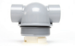
4.5" Bottom Drain Plumbing for Commercial Filters.