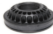
2.5" Threaded top/bottom Res./LC Cap threaded connection.