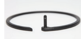
Snap Ring with I.D. Tag connection.