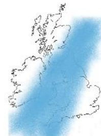
Arsenic bearing rocks

Arsenic compounds are toxic even at low levels. They can cause skin and liver disorders, circulatory problems and can be life threatening. The European Union has looked at the Arsenic levels in water and reduced the allowable limit to below 10ug/l (from 50ug/l). Arsenic is present in underground rocks and percolates in to the ground water and then up through boreholes or springs into the water supply.