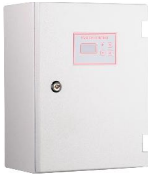
AM 24 – 50 – 60